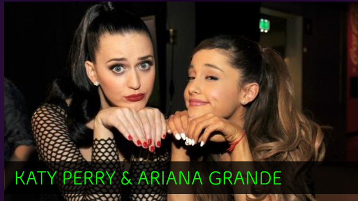
KATY PERRY & ARIANA GRANDE