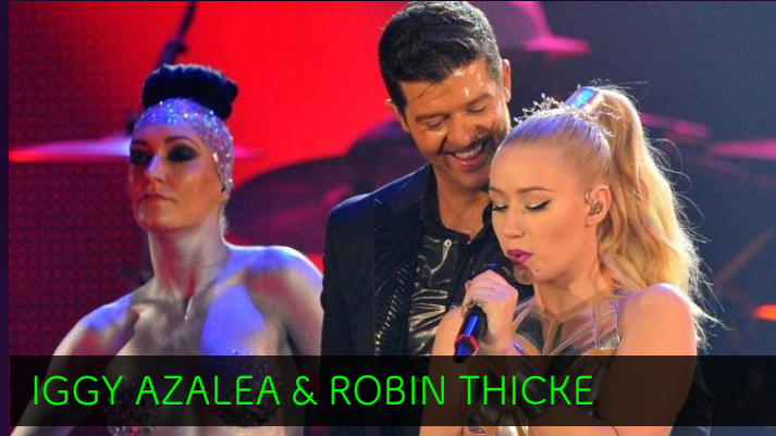
IGGY AZALEA & ROBIN THICKE