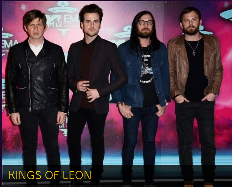
KINGS OF LEON